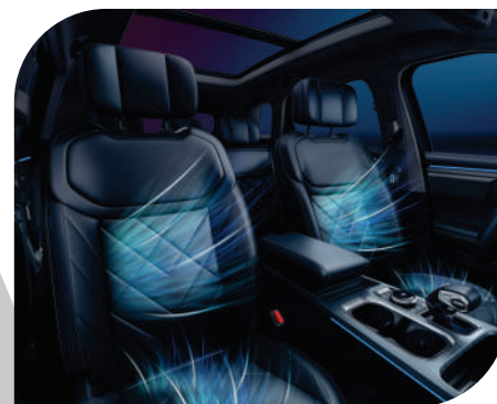
Ventilated & Heated Seats