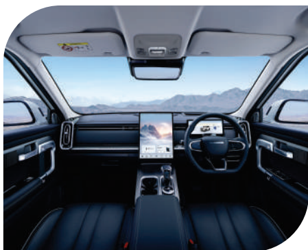
Intelligent Technology Cabin