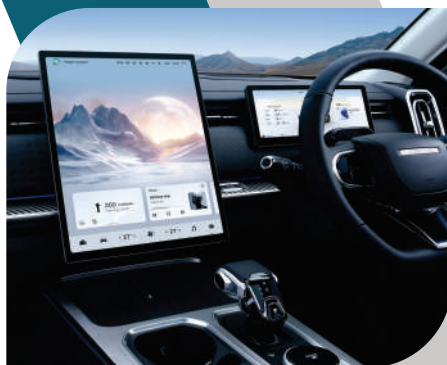
Central Display 14.8 inch (AWD) | 13.2 inch (2WD)