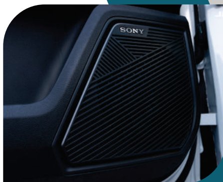
SONY Surround Sound System