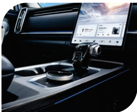
Futuristic Transmission Shifter