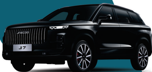
Carbon Crystal Black