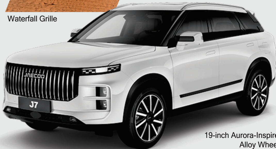
19-inch Aurora-Inspired Alloy Wheels