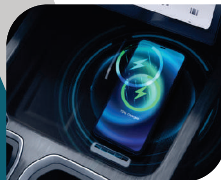
50W Air-cooled Wireless Charger