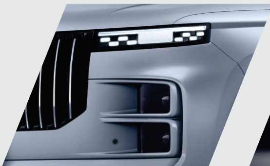
Unique LED Daytime Running Lights